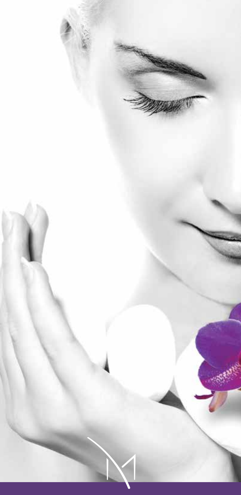
RESORT · SPA · CASINO

12300 Las Vegas Boulevard South | Henderson, NV 89044 702.797.1800 | theMresort.com